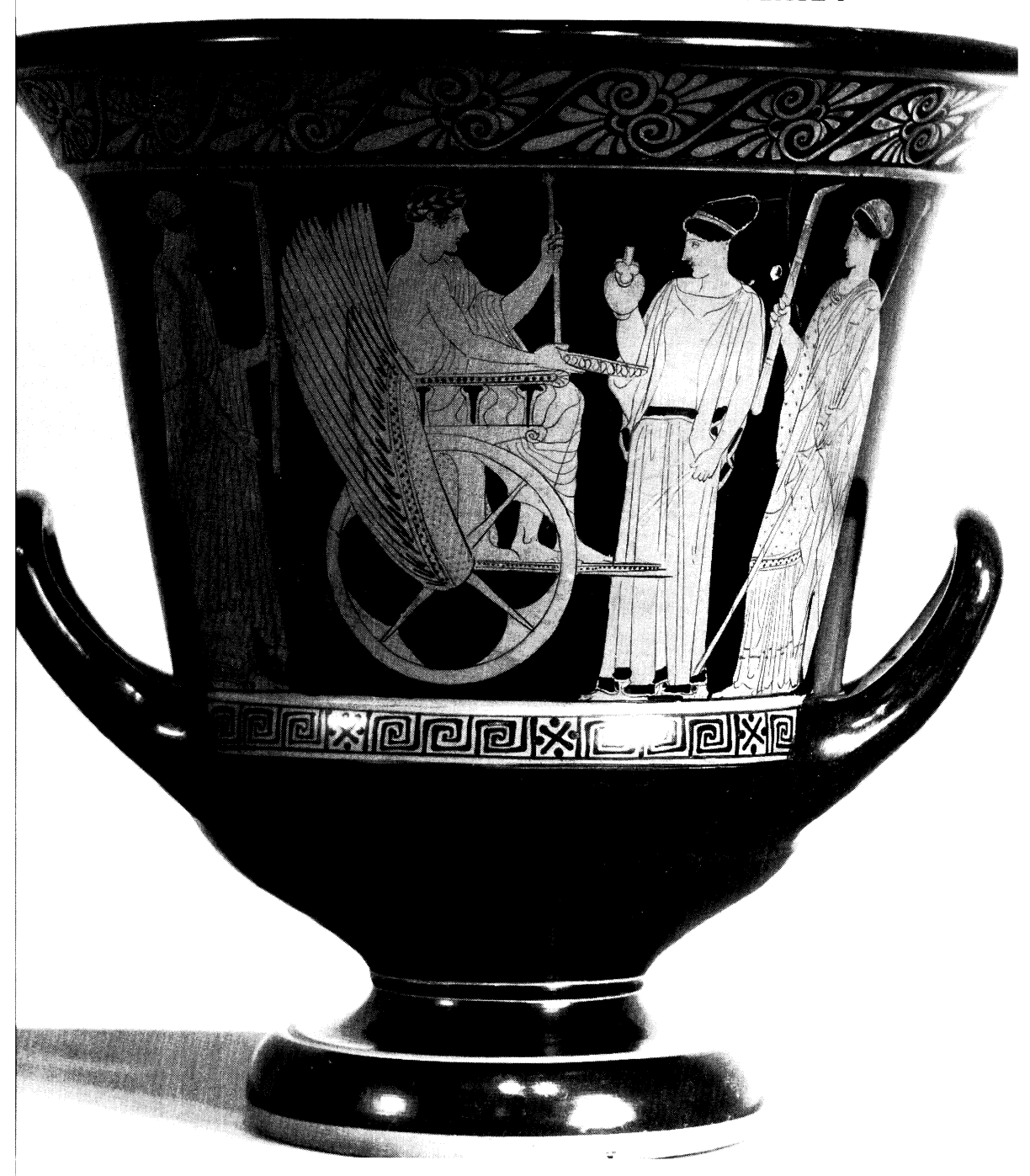
Mission of Triptolemus. Red-figure calyx krater by Polygnotos, ca 440 B.C. Duke University Museum of Art DCC 1964.27. Side A.