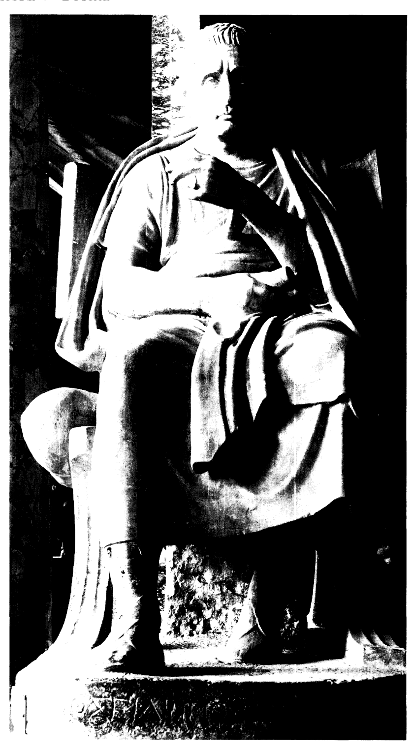
Seated Statue of Posidippus (Vatican Museum, Inv. no. 735)