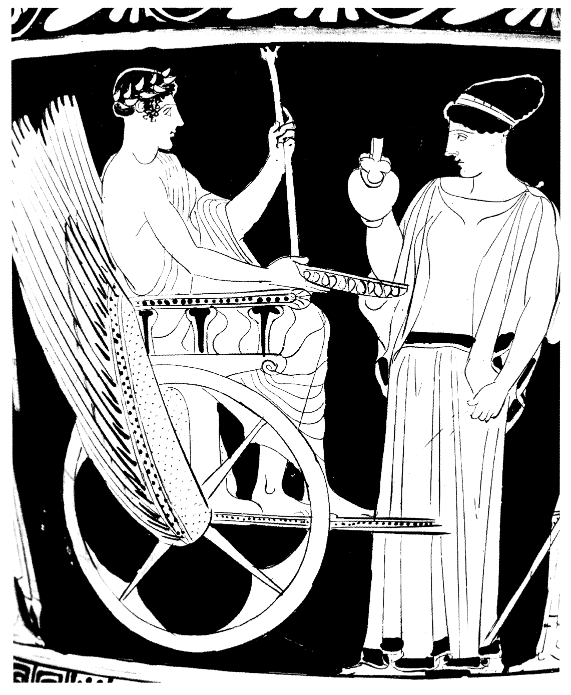
Mission of Triptolemus. Red-figure calyx krater by Polygnotos, ca 440 B.C. Duke University Museum of Art DCC 1964.27. Side A, detail.