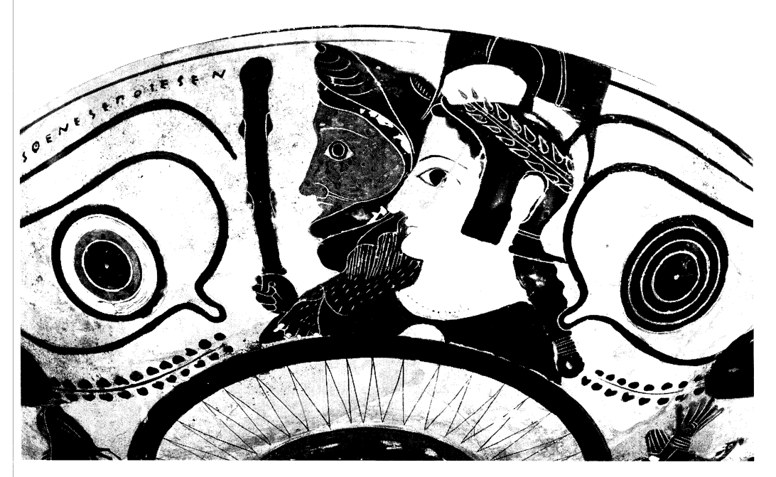
(a) Side A: Athena and Heracles