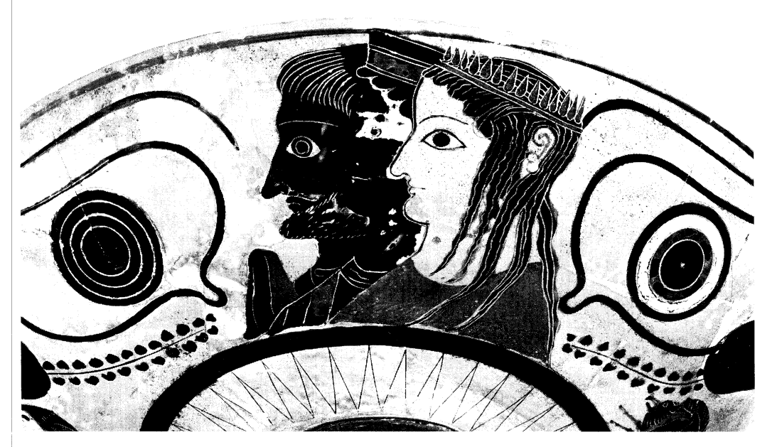
(b) Side B: Persephone, Demeter, and Triptolemus

Black-figure Eye Cup signed by Nikosthenes as potter, ca 530 B.C., Malibu, California, Collection of the J. Paul Getty Museum, 86.AE.70.